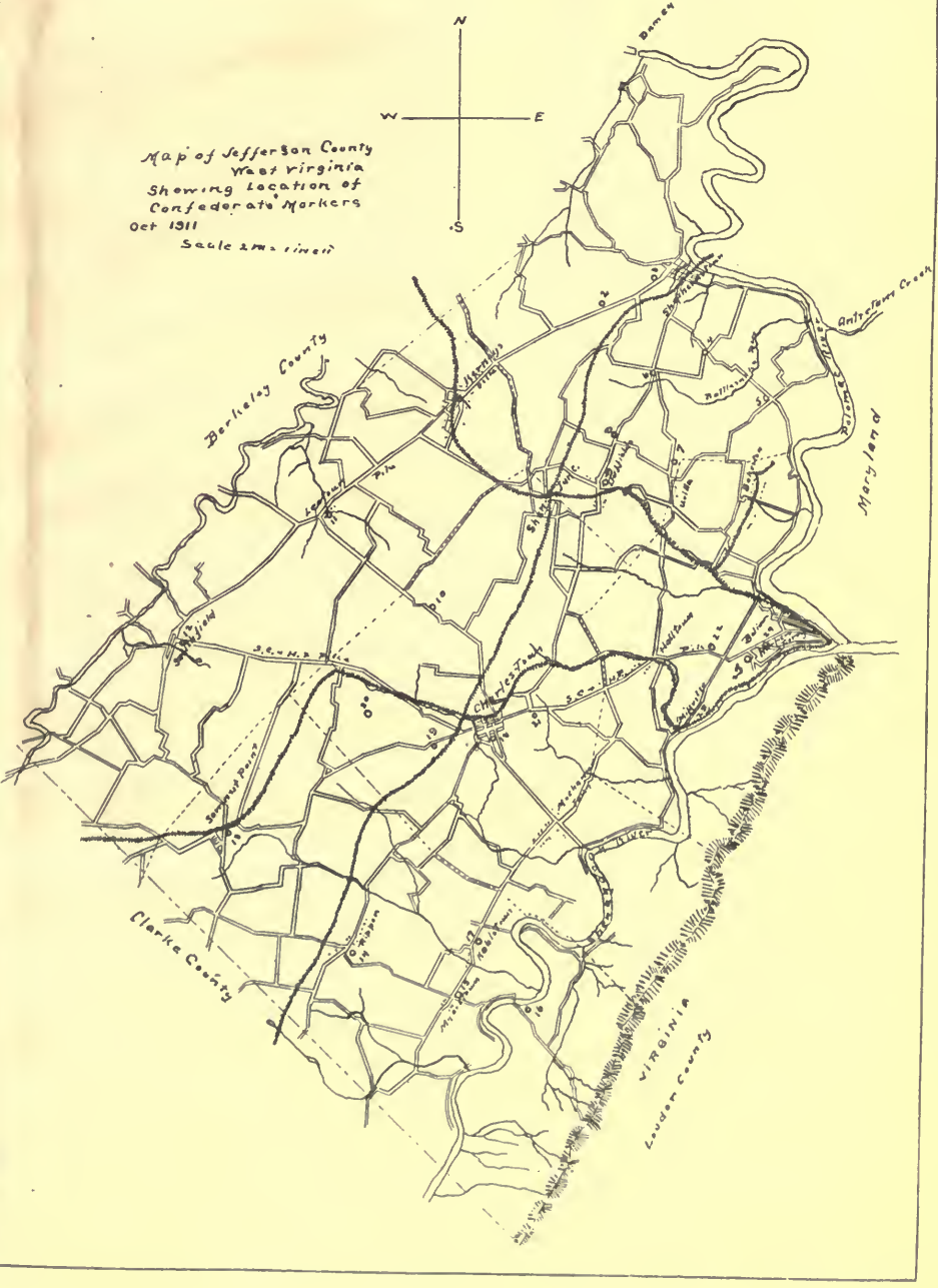
Map of Jefferson County West Virginia Showing Location of Confederate Markers Oct 1911 Scale 2 mi. = 1 inch